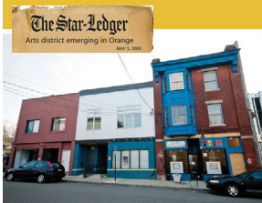
In 2005, HANDS' Valley plan would become the first in the state to receive NRTC funds.

1999: The Network proposes $20 million in state tax credits for affordable homes and neighborhood revitalization. Neighborhood Revitalization Tax Credit program legislation is introduced a year later.